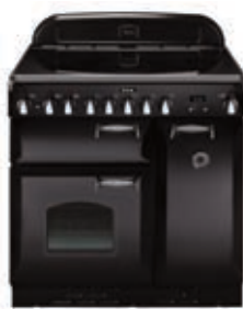
LEGACY 36 ELECTRIC COOKTOP CATHEDRAL DOOR